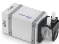
SP280 Peristaltic Pump 2)