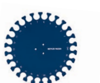
Rack Kit Option 5, 10 and 20 mL 1)