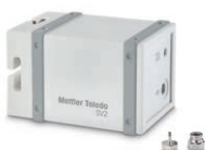
SV2 Gas Switch Valve