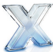
PC software LabX Titration Express/Server