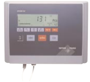
Benchtop model (with cable exit at rear) Wall/stand-mount model (with cable exit below)